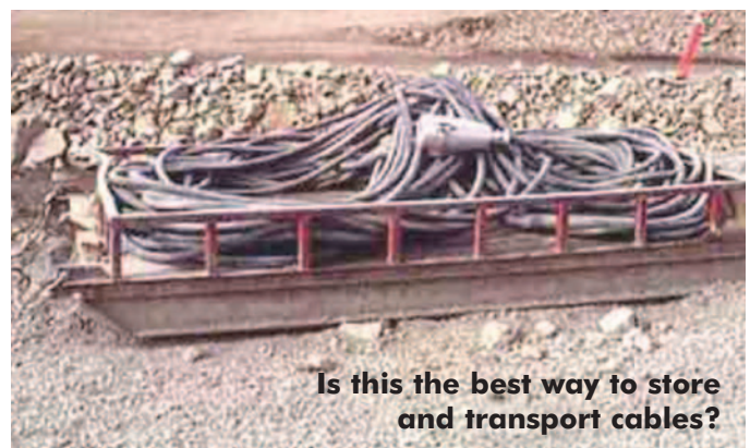
Is this the best way to store and transport cables?