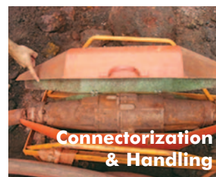
Connectorization & Handling