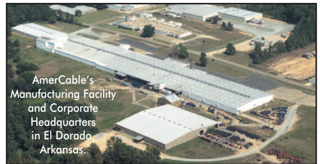
AmerCable's Manufacturing Facility and Corporate Headquarters in El Dorado, Arkansas.