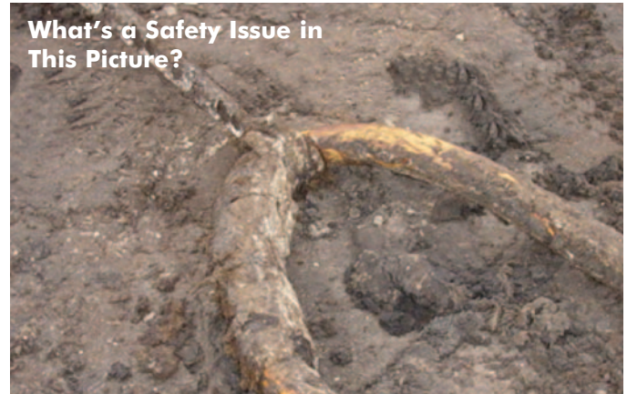
What's a Safety Issue in This Picture?

Longer lasting mining cables means more equipment uptime, greater productivity and lower cable cost per ton. Our experts make sure you're getting the maximum return on your cable dollars.