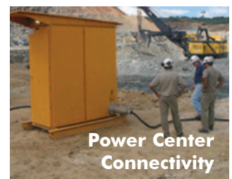
Power Center Connectivity