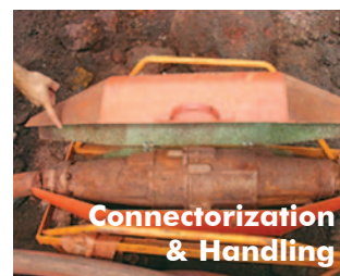
Connectorization & Handling