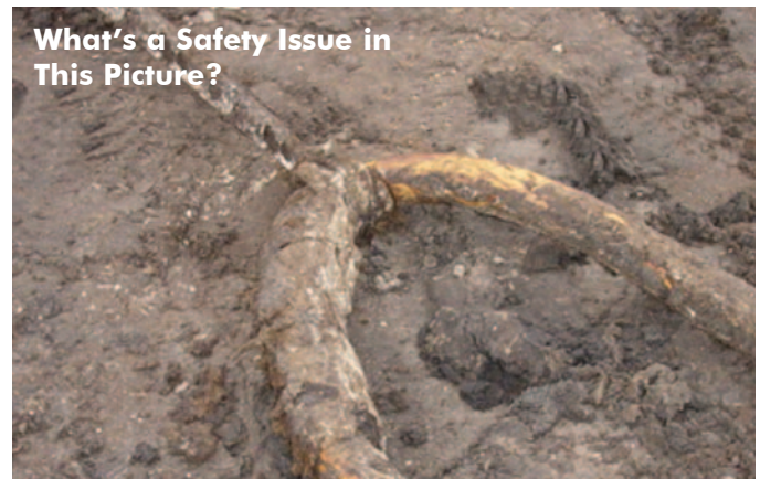
What's a Safety Issue in This Picture?

Longer lasting mining cables means more equipment uptime, greater productivity and lower cable cost per ton. Our experts make sure you're getting the maximum return on your cable dollars.