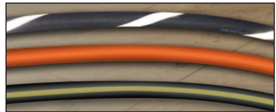
Options include black cable with reflective stripe or solid orange. Standard cable is black with yellow stripe.